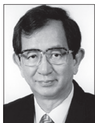
Yuan Tseh Lee

President, International Council for Science (ICSU) Nobel Laureate in Chemistry (1986)